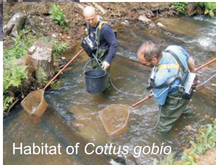
Habitat of Cottus gobio

Ecological Water Engineering We develop natural pathways for fish and other water organisms. We improve structures of water bodies and help to store water in landscape.